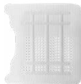
RPM250PDML 38 mm x 38 mm