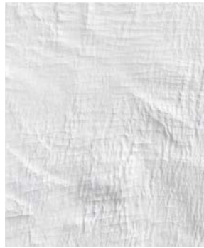
40 x 50 mm