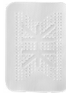
RPM250XLK 30 mm x 40 mm