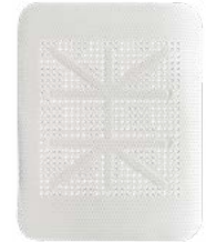
RPM250K2 40 mm x 50 mm