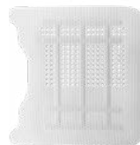
RPM250PDMR 38 mm x 38 mm