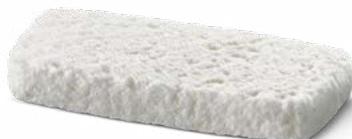
20 x 40 x 6 mm