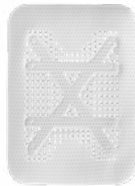
RPM250XL 30 mm x 40 mm