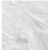
25 x 25 mm