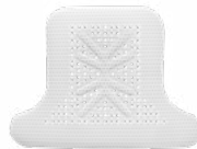
RPM250PLT 30 mm x 41 mm