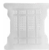
RPM250PTCM 38 mm x 38 mm