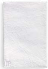
20 x 30 mm