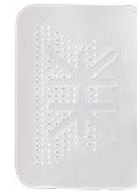
RPM250XLKM 30 mm x 40 mm