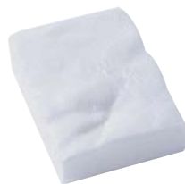
20 x 30 mm