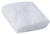
15 x 20 mm