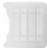
RPM250PD 38 mm x 38 mm