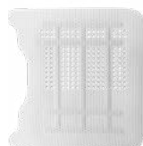
RPM250PDMR 38 mm x 38 mm