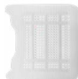
RPM250PD 38 mm x 38 mm