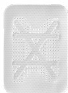
RPM250XL 30 mm x 40 mm