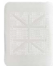
RPM250K2 40 mm x 50 mm