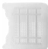
RPM250PDML 38 mm x 38 mm