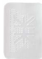
RPM250XLKM 30 mm x 40 mm