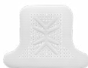
RPM250PLT 30 mm x 41 mm