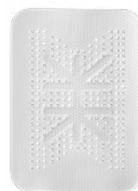
RPM250XLK 30 mm x 40 mm